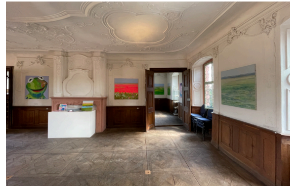
New Archive, Wertheim Castle (detail)

iban: DE28 4401 0046 0223 2484 66 bic: PBNKDEFF440 bank: Postbank usst-id: DE 124 778 004 venue: Dortmund/Germany